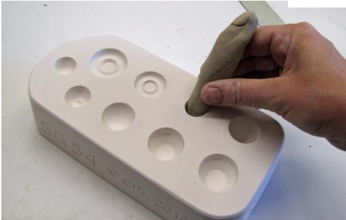
Using SG54 Feet Sprig Mold